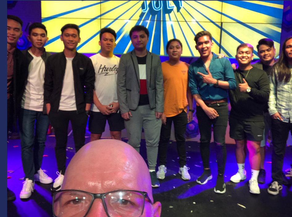
100 Outbound Telemarketing Sales Averaging 150 calls per day

OFFSHORE COST ARE ABOUT THIRD OF US SALARIES